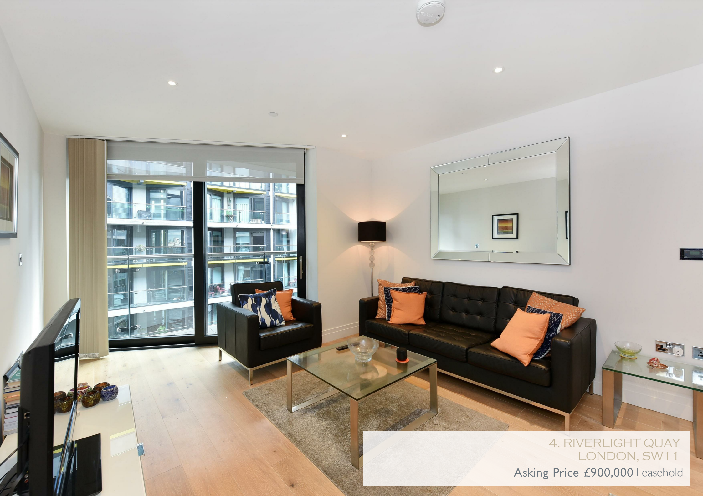
4, RIVERLIGHT QUAY LONDON, SW11 Asking Price £900,000 Leasehold